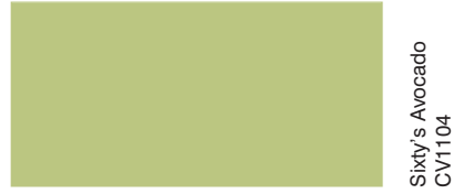
Sixty's Avocado CV1104