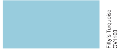
Fifty's Turquoise CV1103