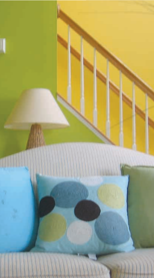
Colours that shaped the decade.

Retro patterns abound with bold, graphic patterns and nostalgia are the key to designing many colour schemes. Decades are identified by a single colour, pair or trio, in the mood that shaped that decade.