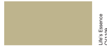
Life's Essence CV1109