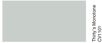
Thirty's Monotone CV1101