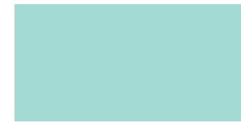
Dancing Gown CV1123