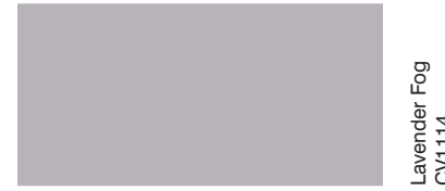
Lavender Fog CV1114