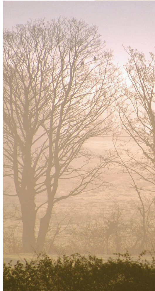
Colours with no borders.

In the morning, light colours appear as shadows with a softness that belies it's true hue. Softened edges give the observer the feeling that there are no borders, one colour fades into another. Gentle colours ease our souls, relax our minds, and offer us peace of mind.