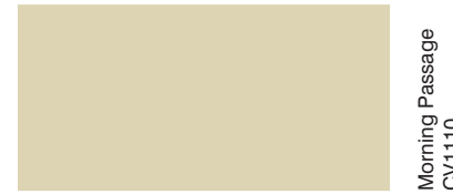
Morning Passage CV1110