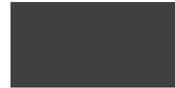
Rocker Black CV1122