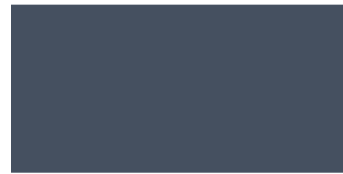
Come On In! CV1115