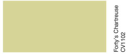
Forty's Chartreuse CV1102